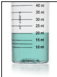
STEP 2 &amp; 5

5 Add 2 drops of Total Alkalinity Indicator (AI6925) and swirl to mix. The sample will turn green.